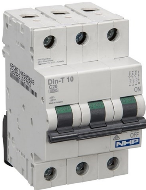
Representative Photo Only (actual product may vary based on configuration selections)