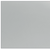
Polished Stainless Steel ST75