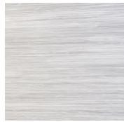
Brushed Stainless Steel ST75NK